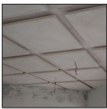
False ceiling - Lounge

2. Woodwork. Proper semi-solid wooden doors with solid yellow pine