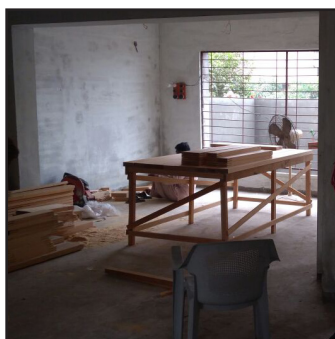
Woodwork under way

1. False Ceiling. False ceiling of the entire house has been completed. Exquisite, modern and